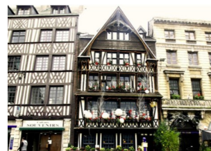
Four Rouen Images from Google