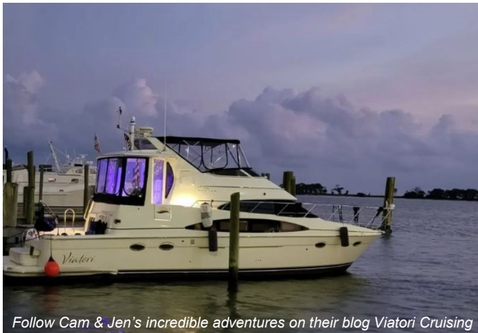
Follow Cam & Jen's incredible adventures on their blog Viatori Cruising