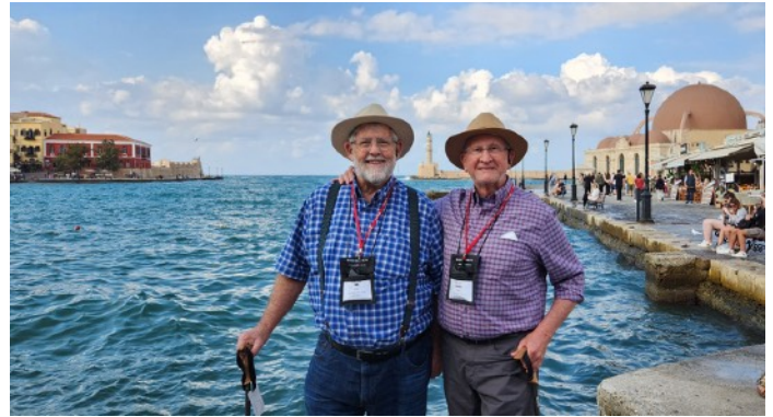
In Plaka, Crete

In the fall of 2024, my husband and I enjoyed a tour of Athens, Greece, plus some time on a small ship on the Aegean and Mediterranean Seas. We fell in love with the friendly people of Greece! All our lives, we'd heard about the history of Greece, the art and archeology, the sunny climate--and even the food and wine of Greece. All of these surpassed our expectations.